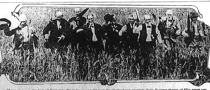
These men are the last of Pickett's Brigade, re-enacting at the Gettysburg reunion their famous charge of fifty years ago.