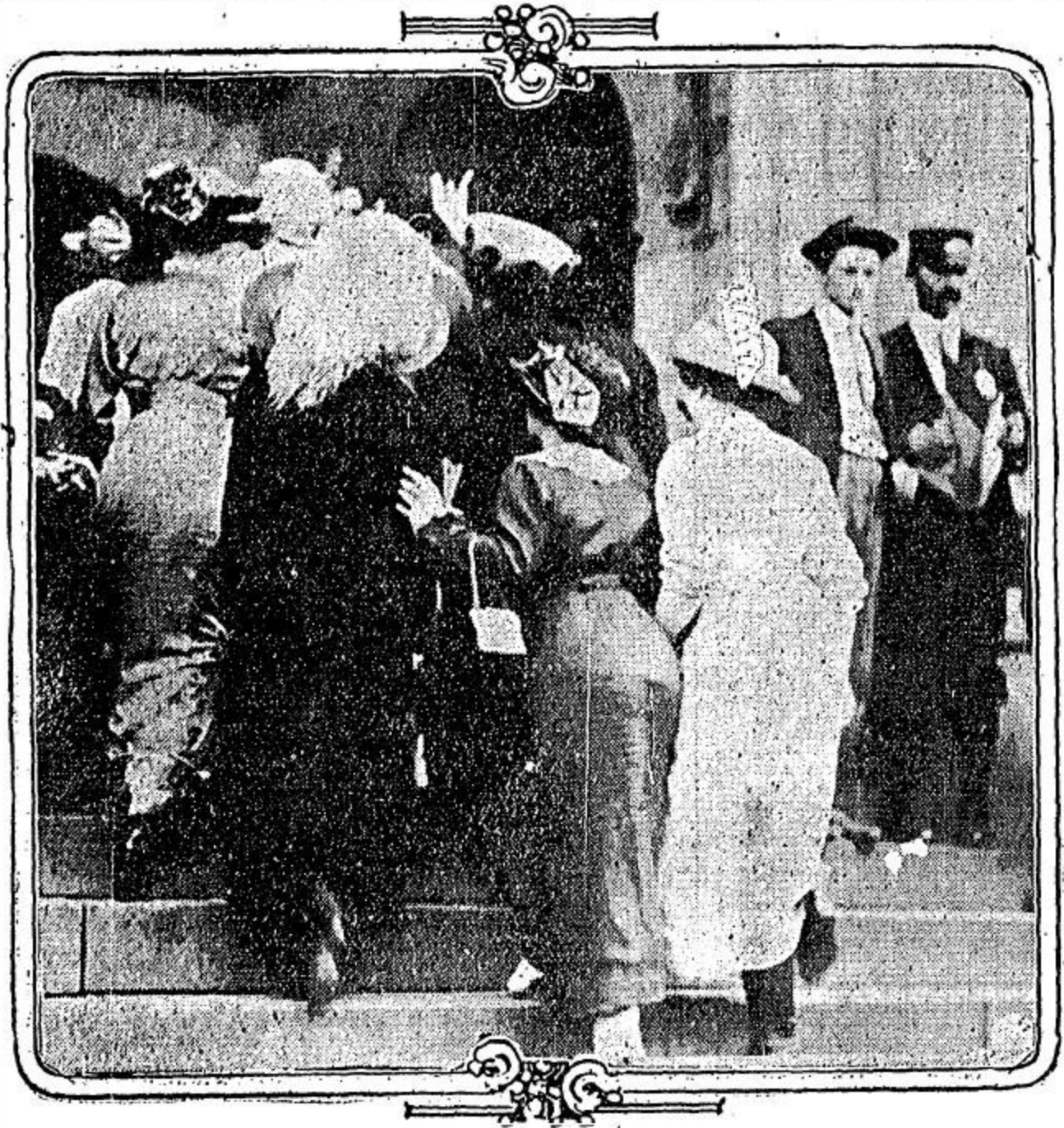
Employees of National Pencil company entering police station, where they were, summoned Thursday afternoon as witnesses in the Mary Phagan inquest.