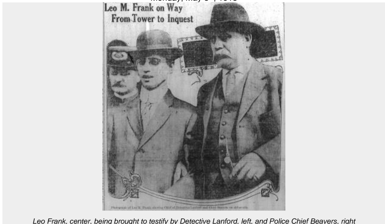
Leo Frank, center, being brought to testify by Detective Lanford, left, and Police Chief Beavers, right