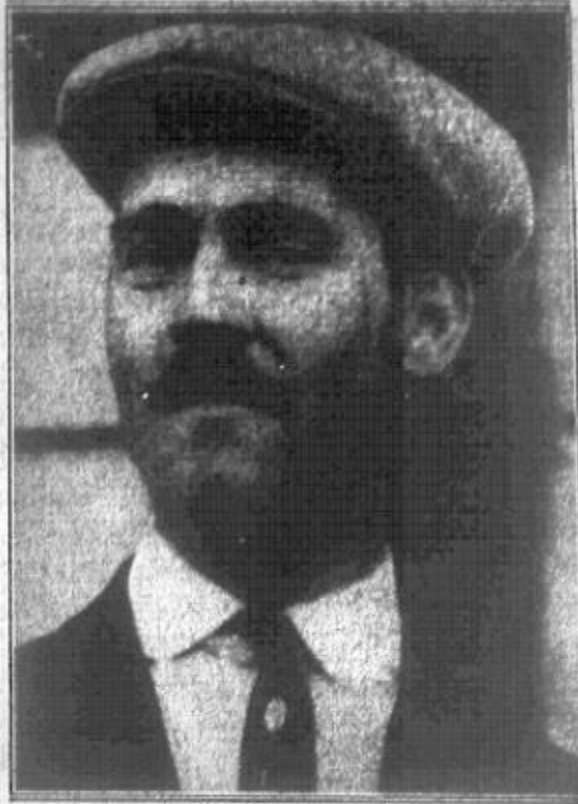
LEMMIE QUINN. Foreman, who testified that he visited the factory and talked to Mr. Frank just after Mary Phagan is supposed to have left with her pay envelope. He was given a searching examination by the coroner Thursday, but stuck to his statement.