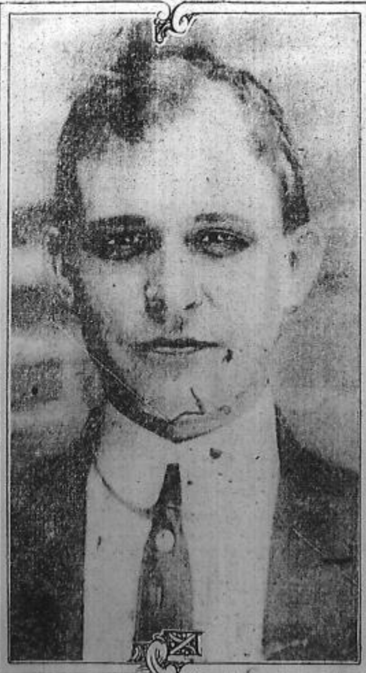
Solicitor General Hugh Dorsey.

HUGH DORSEY: Solicitor General of Fulton Superior Court, now bending every effort toward the solution of the Phagan mystery. He is following every clw, and in every way exerting all his powers and ability in clearing the baffling case.